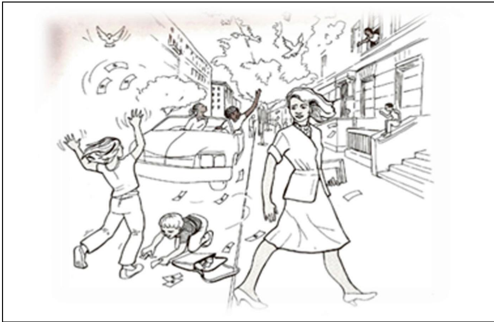
Figure 1. Picture prompt A, PIAT-R/NU written expression. (Markwardt, 1998)

test administrator left the room, to avoid making the participants feel that the investigator was scrutinizing their writing. A stopwatch was left in the room so that the participant would be aware of how much time remained. A small number of participants exited the room before the full twenty minutes had expired, stating that they had completed their stories, but the vast majority were asked to stop writing at the 20 minute marker, regardless of where they were in the story.